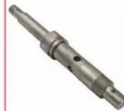
CNC Aluminum Parts