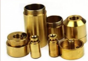
CNC Brass Parts