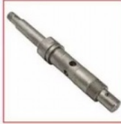
CNC Aluminum Parts