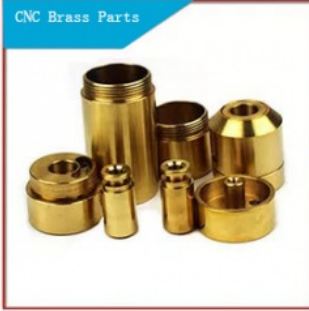
CNC Brass Parts