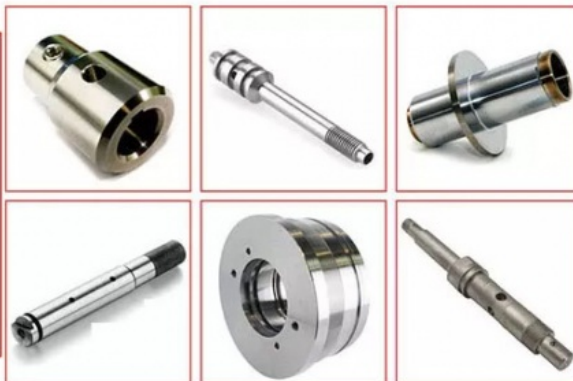
CNC Aluminum Parts