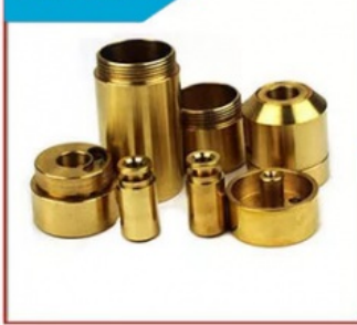
CNC Brass Parts