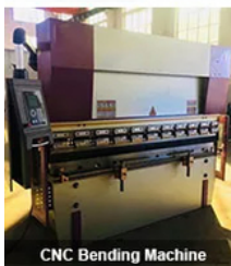
CNC Bending Machine