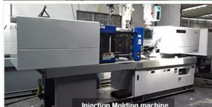
Injection Molding machine