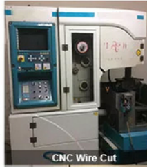
CNC Wire Cut