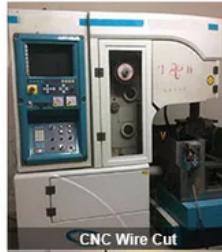
CNC Wire Cut