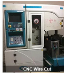
CNC Wire Cut