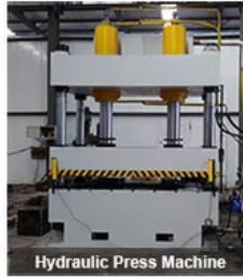
Hydraulic Press Machine