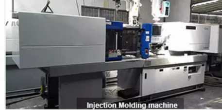
Injection Molding machine