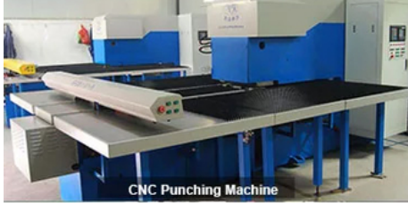
CNC Punching Machine