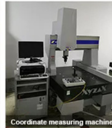
Coordinate measuring machine