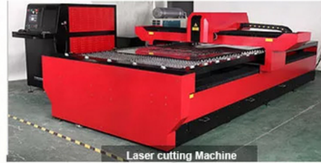
Laser cutting Machine