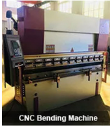
CNC Bending Machine