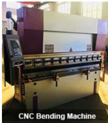
CNC Bending Machine