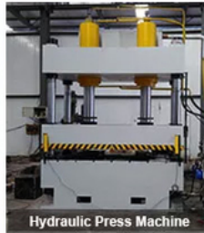
Hydraulic Press Machine