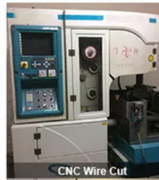
CNC Wire Cut