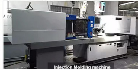
Injection Molding machine