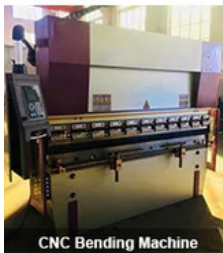
CNC Bending Machine