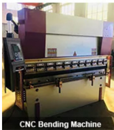
CNC Bending Machine