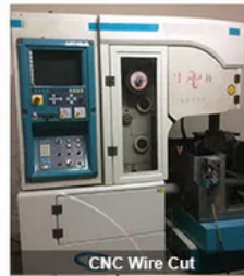
CNC Wire Cut