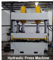
Hydraulic Press Machine