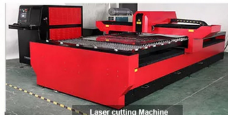
Laser cutting Machine