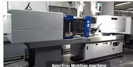
Injection Molding machine