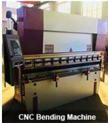
CNC Bending Machine