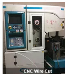
CNC Wire Cut