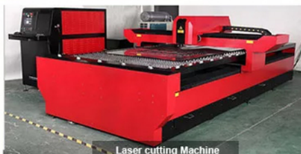
Laser cutting Machine