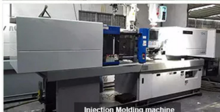
Injection Molding machine