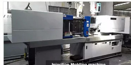
Injection Molding machine