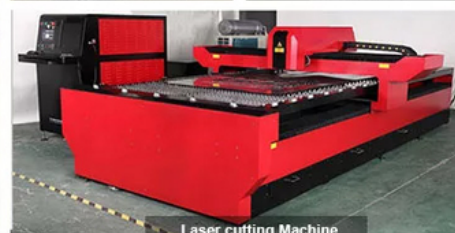
Laser cutting Machine