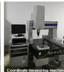
Coordinate measuring machine