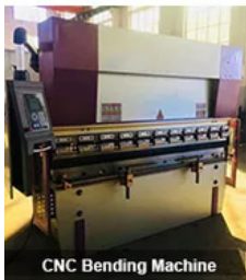
CNC Bending Machine