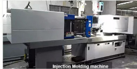
Injection Molding machine