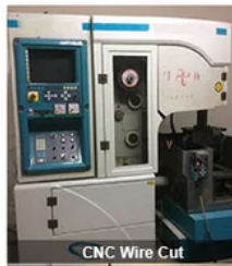
CNC Wire Cut