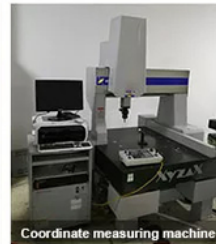
Coordinate measuring machine