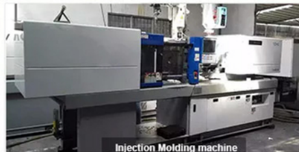
Injection Molding machine