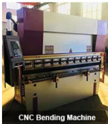
CNC Bending Machine