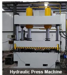
Hydraulic Press Machine