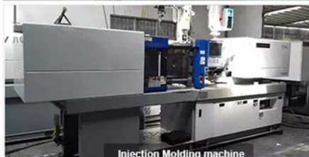
Injection Molding machine