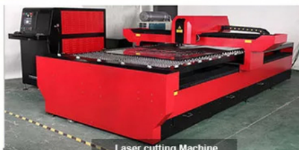
Laser cutting Machine