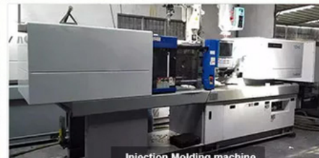
Injection Molding machine