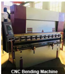
CNC Bending Machine