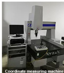
Coordinate measuring machine