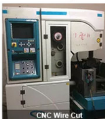
CNC Wire Cut