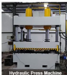
Hydraulic Press Machine