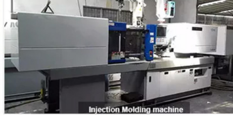
Injection Molding machine