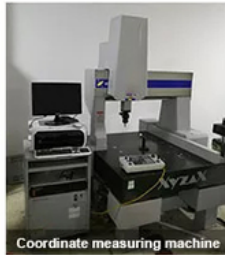
Coordinate measuring machine