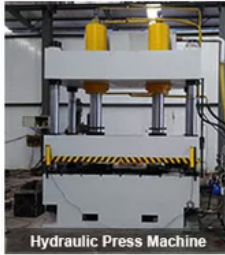
Hydraulic Press Machine