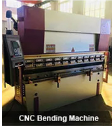
CNC Bending Machine