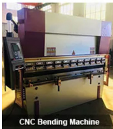
CNC Bending Machine