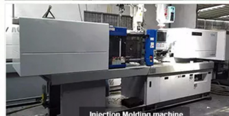
Injection Molding machine