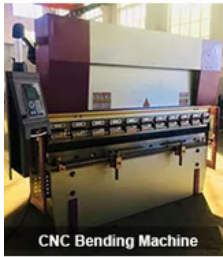
CNC Bending Machine