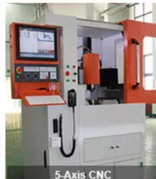
5 Axis CNC