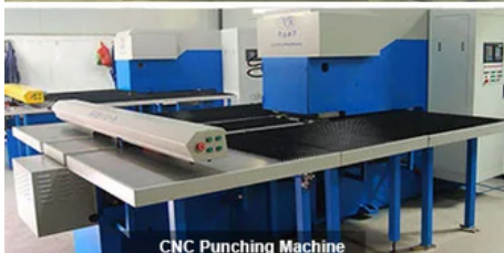
CNC Punching Machine