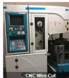
CNC Wire Cut