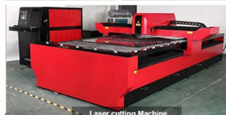
Laser cutting Machine