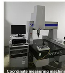
Coordinate measuring machine