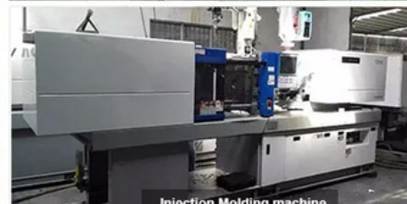
Injection Molding machine