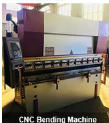
CNC Bending Machine