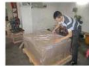
Stretch Film Wrapping