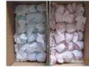
Anti-Rust Paper Packing