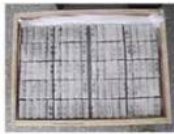
Stretch Film Packing