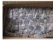
Bundling & Bubble Bag Packing