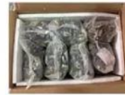
Plastic Bag & EPE Foam Packing