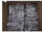
Bundling & Plastic Bag Packing