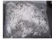
Plastic Bag Packing