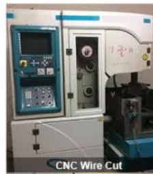
CNC Wire Cut