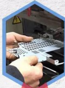
Sheet Metal Service