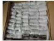
EPE Foam Packing