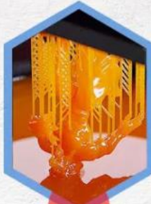
SLS SLA Service