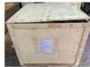
Wooden Case Outside