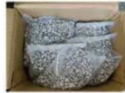
Plastic Bag Packing