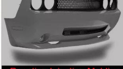
Reaction Injection Molding