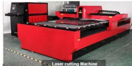
Laser cutting Machine