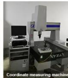
Coordinate measuring machine