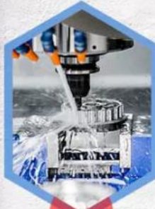
CNC Machining Service

At Xiange technology, we focus on providing you with the finest services in rapid prototyping, rapid tooling and low-volume manufacturing. Our international team of engineers and technicians are dedicated to making your custom parts using the most advanced equipment and techniques including 3D metal printing, multi-axis CNC machining and plastic injection molding.