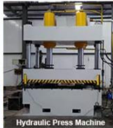
Hydraulic Press Machine