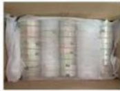
EPE Foam Packing