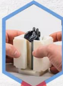
Vacuum Casting Service