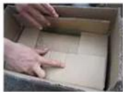
3 Layers of Carton