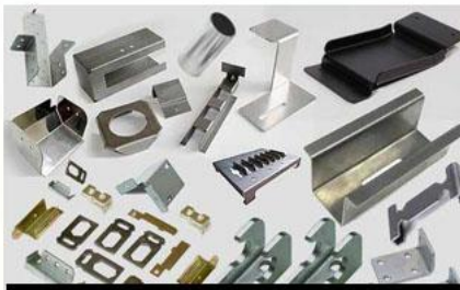
Metal sheets fabrication