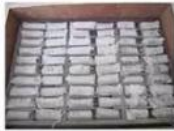
EPE Foam & Plastic Box Packing